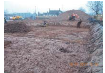
Excavation of basement plant room

During December the brick and concrete rubble was crushed for re-use on site as a mat on which the new leisure centre will be built.