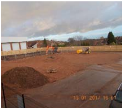
View of cleared site

ISG Construction Ltd are the principal contractor for the construction of the new Northfield Leisure Centre. As an associate member of the Considerate Constructors Scheme, ISG are committed to providing a first class service.